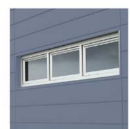
WAF ALUMINIUM FRAMED WINDOWS, POWDERCOAT FINISH TO MATCH ADJACENT WALL COLOUR