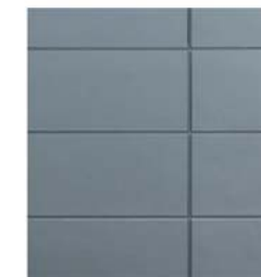
FC PAINTED FC CLADDING BOARDS WITH HORIZONTAL PATTERN