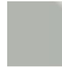
COLORBOND SHALE GREY