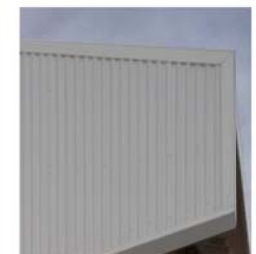
MTCL RAISED SEAM PROFILE CLADDING. 'TRIMDEK' COLORBOND SHALE GREY