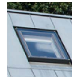
WRSL SKYLIGHTS TO BOAT STORE