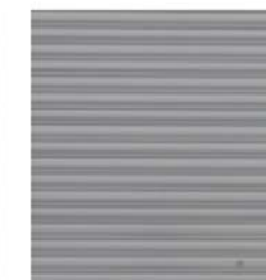
DRSH ROLLER DOOR TO BOAT SHED COLORBOND SHALE GREY