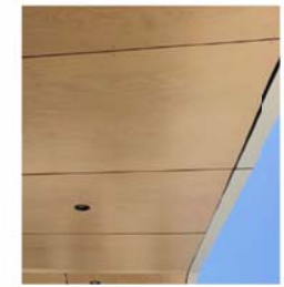
PLY PLYWOOD SOFFIT