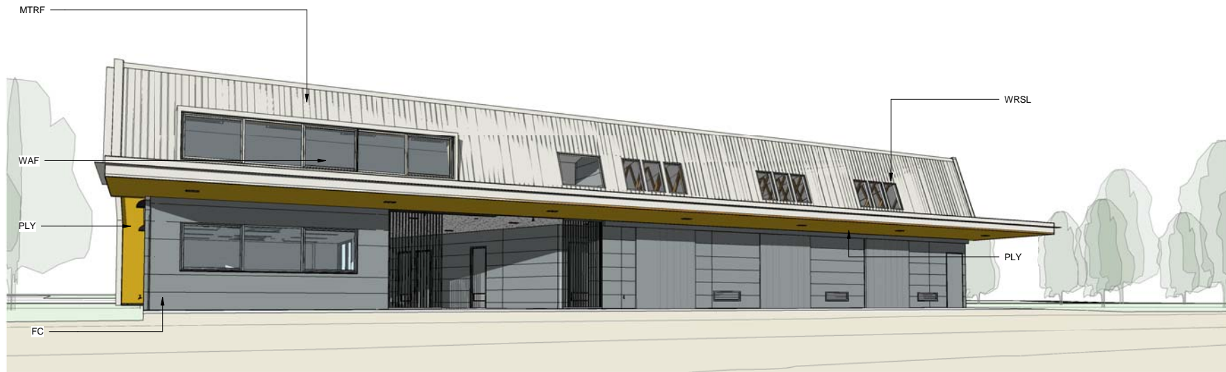
MATERIAL SCHEDULE SOUTHERN (LAKE) ELEVATION