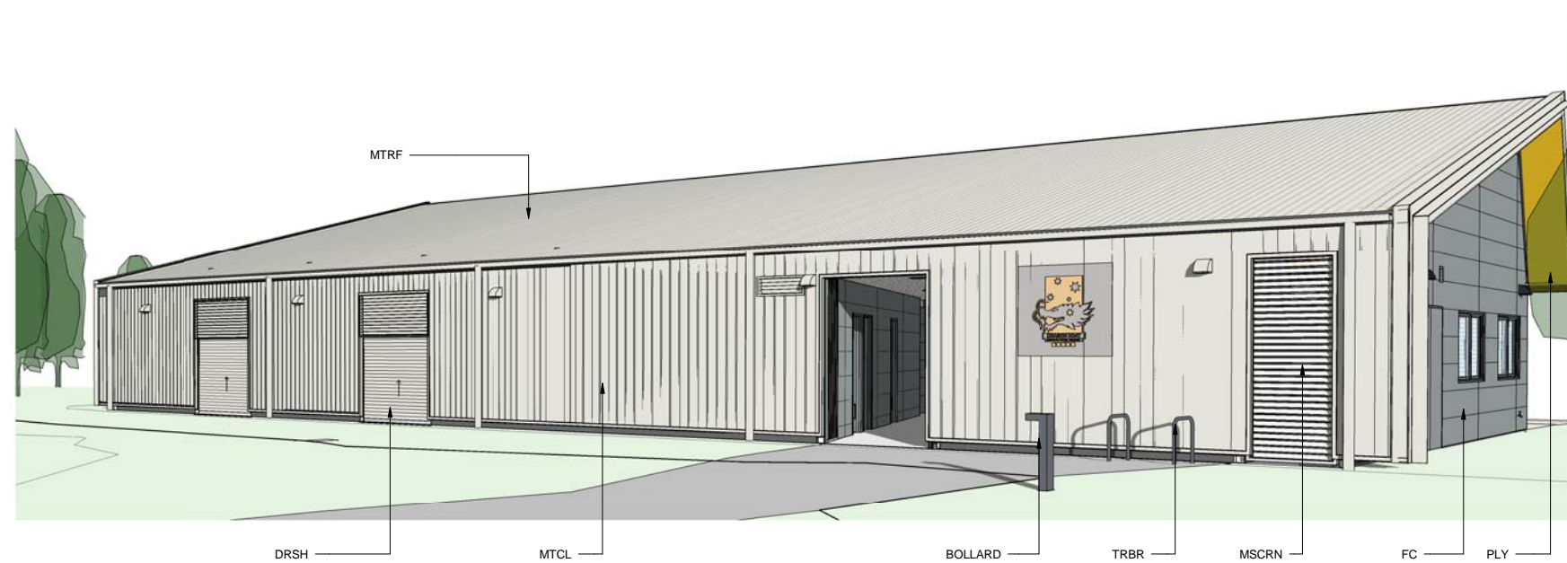
MATERIAL SCHEDULE NORTHERN ELEVATION