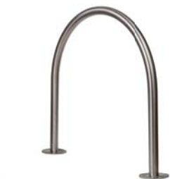
TRBR BICYCLE HOOP STAINLESS STEEL FINISH 850MM HIGH X 850MM WIDE