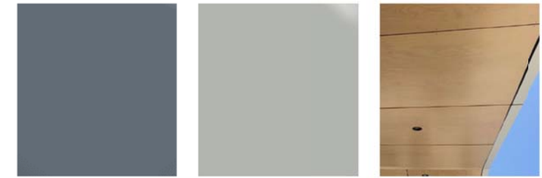
PT1 MID BLUE GREY