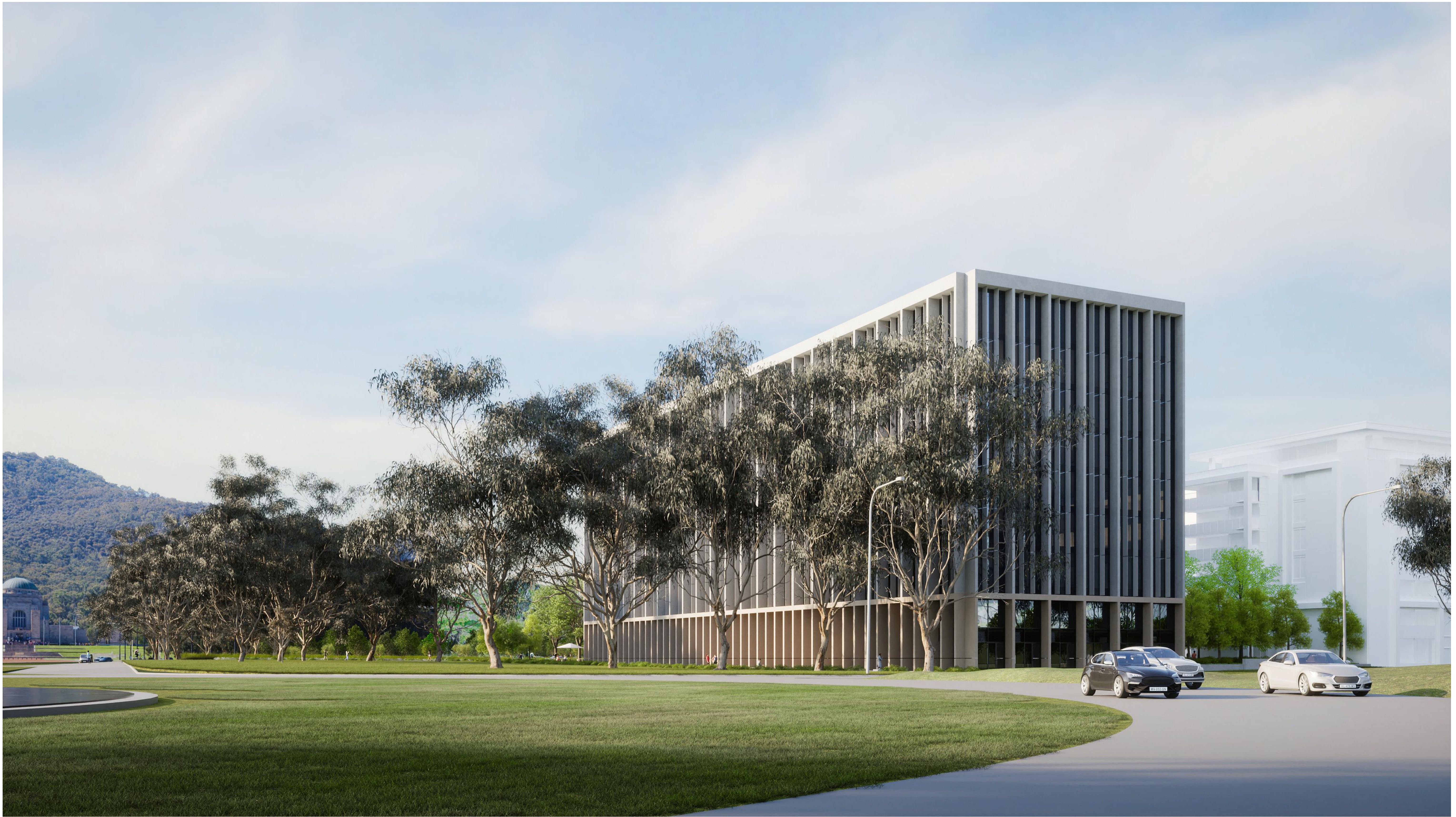
Perspective - Parkes Way