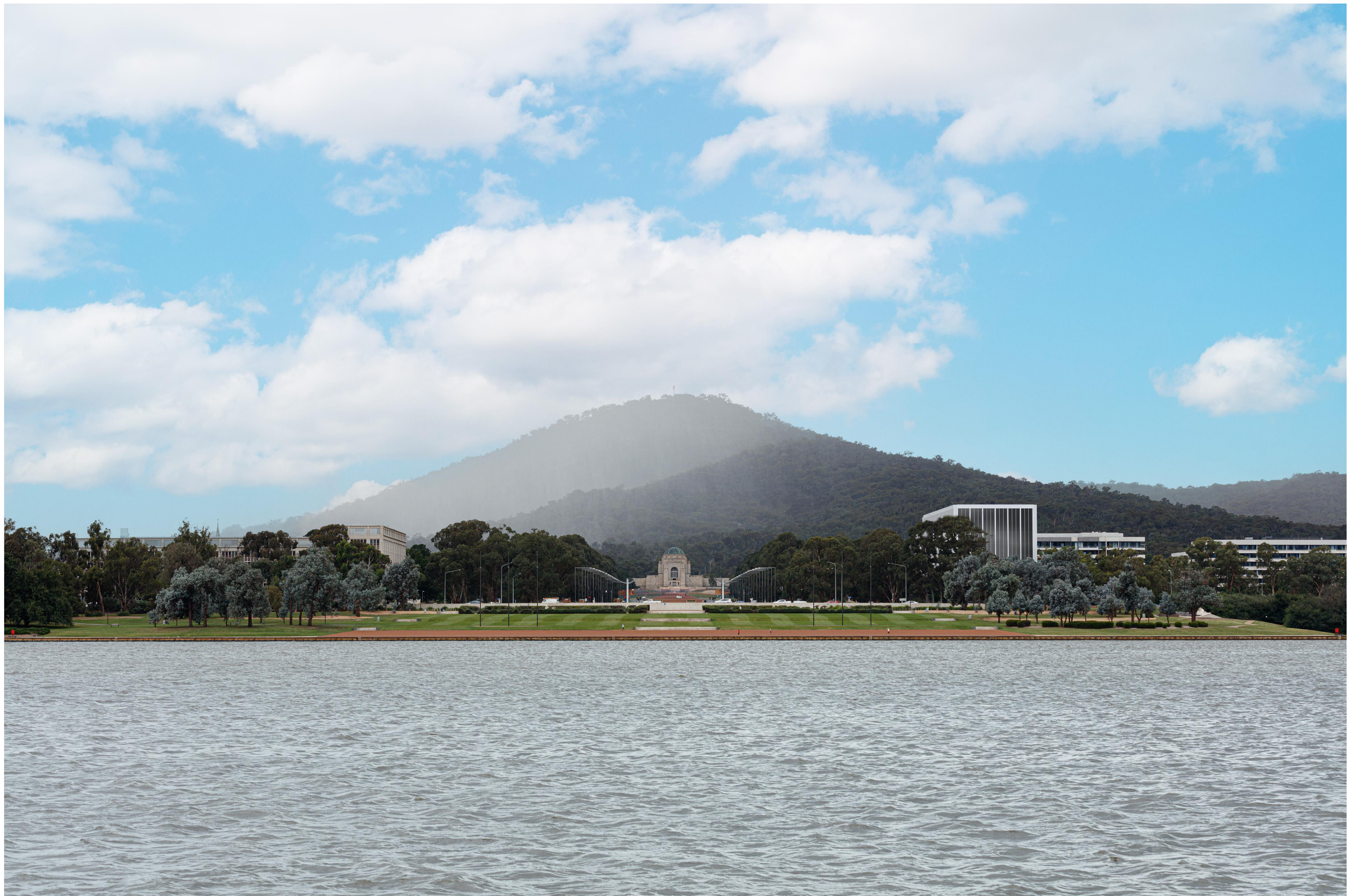
Perspective - Lake View ( new APE Portal shown )