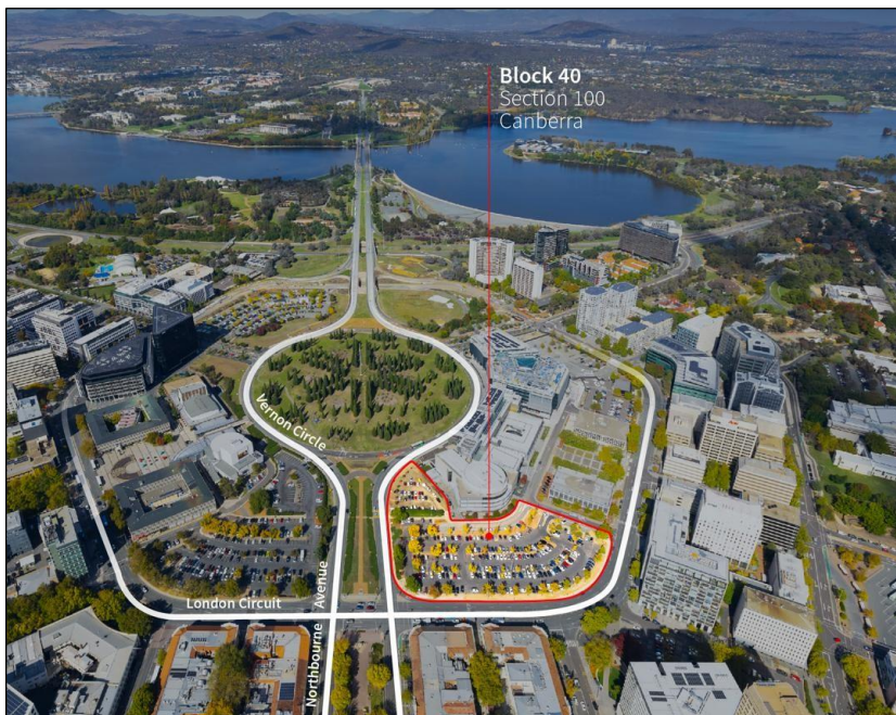
Figure 1: Site and Locality Plan for Block 40 Section 100 City.

This Consultation Report should be read in conjunction with the Planning Report and various other plans and specialist reports submitted with the WA.