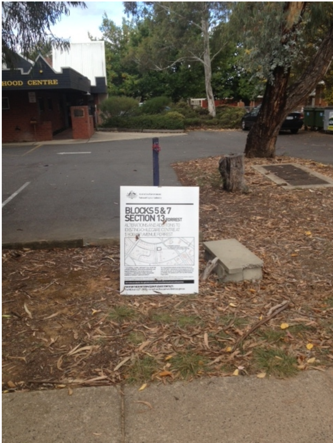
Attachment C – Notification sign on site between 15 March and 9 April 2013.