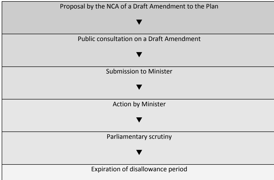
Table 1 - National Capital Plan amendment process

The process for amendments to the Plan is outlined in Table 1 .