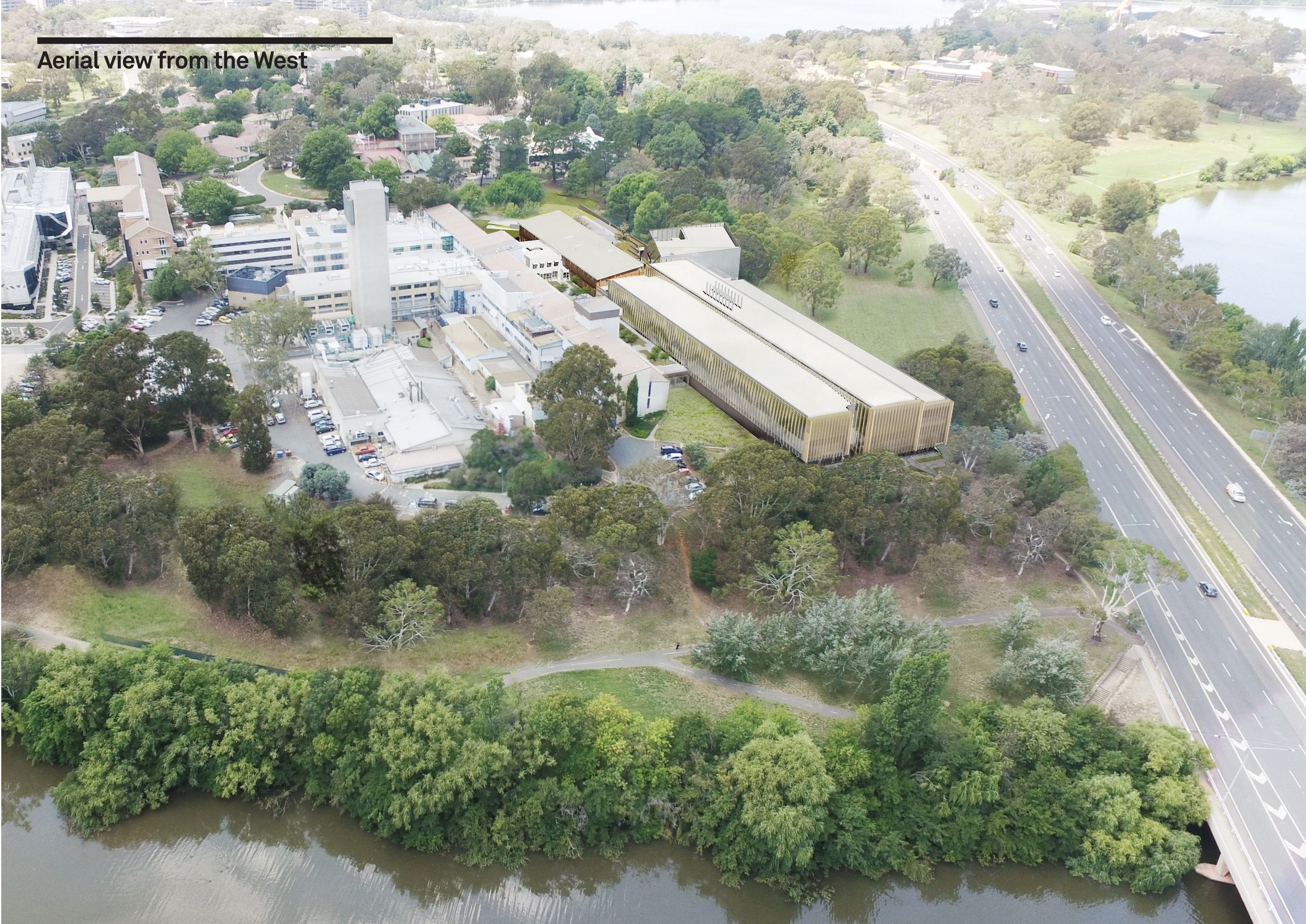
Aerial view from the West