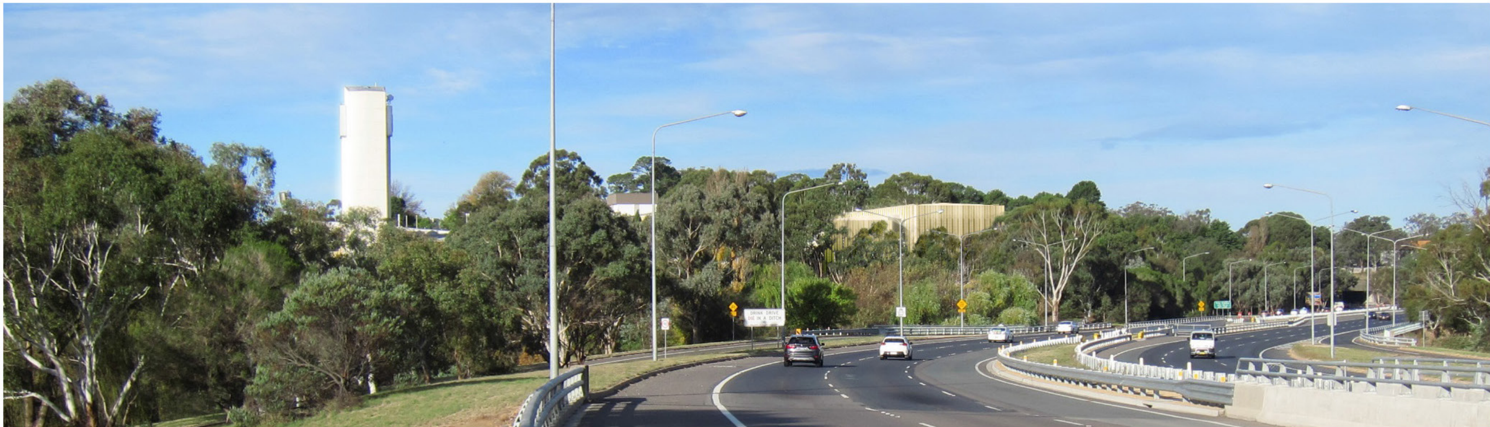
Proposed – Stage 1