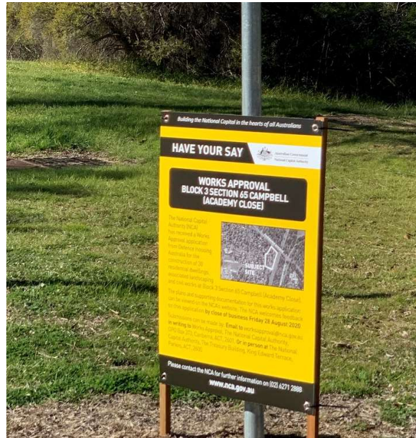
Site Sign # 1