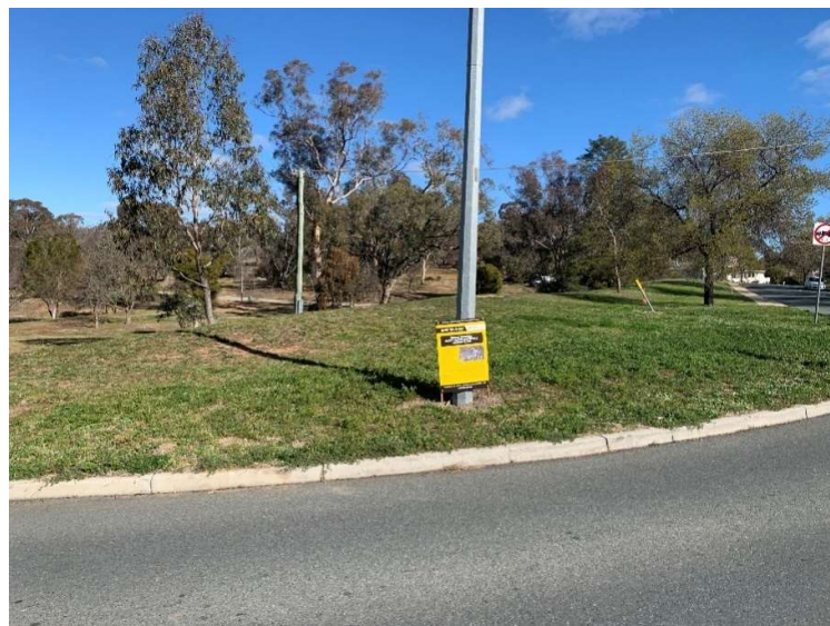
Site Sign # 2