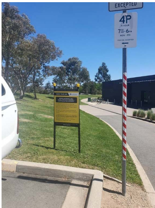
Site Notice – Sign 2