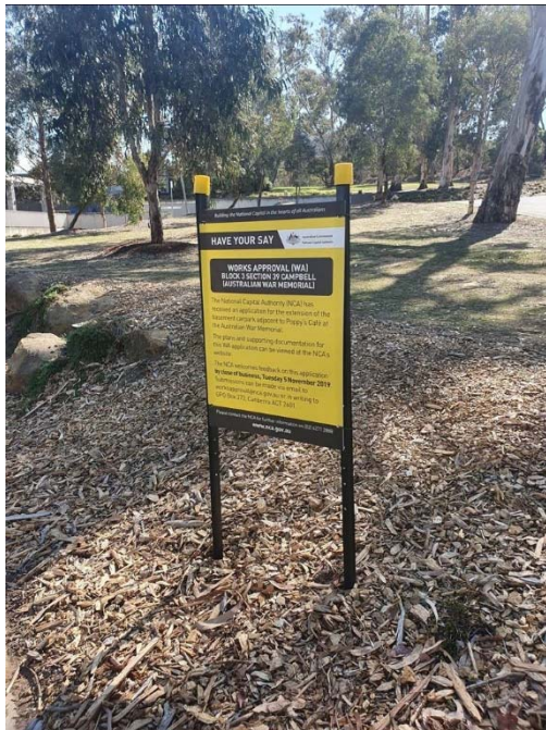
Site Notice – Sign 1